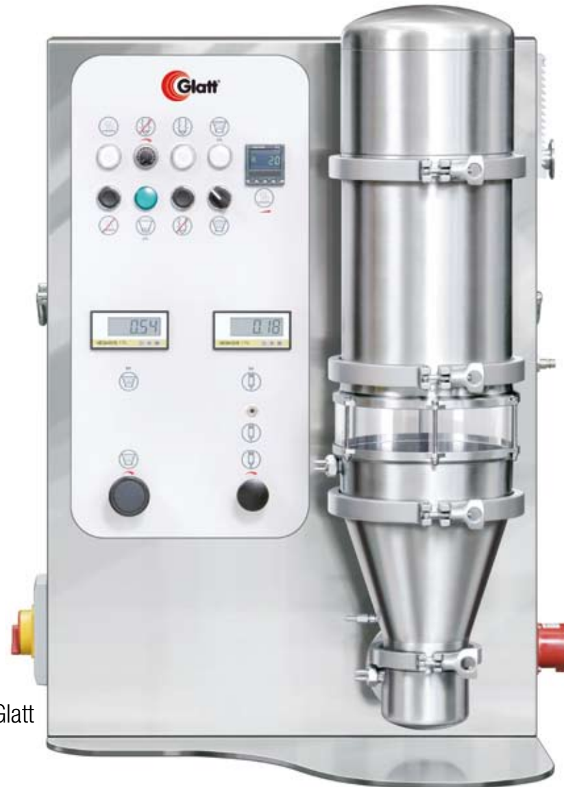
The new Midi-Glatt