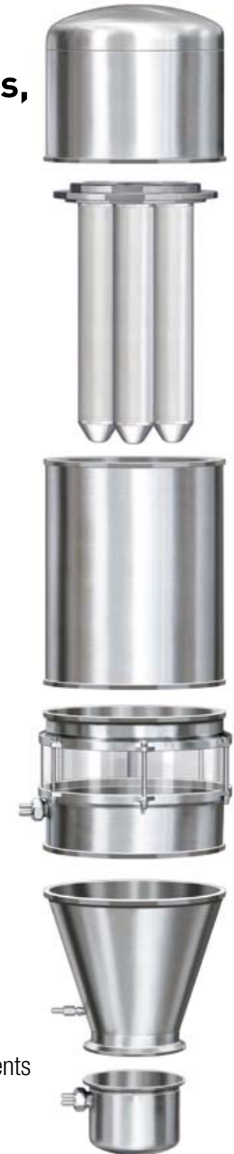
The new Midi-Glatt components